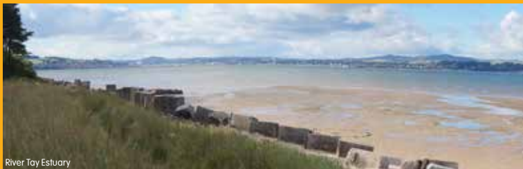
River Tay Estuary

At the first major junction after the point, (second on map) head left on a surfaced forest track and follow this line of Beech trees back towards the car park. At junction marker 2, follow the sign left to return to the car park near the gate.