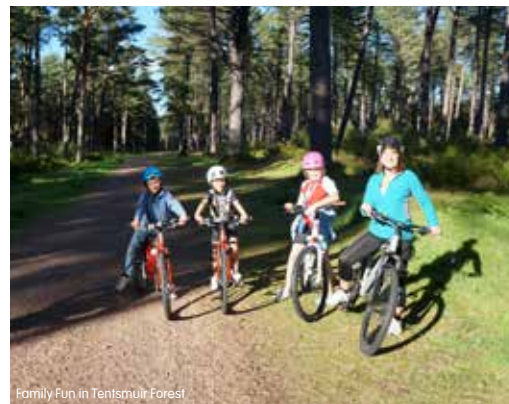
Family Fun in Tentsmuir Forest