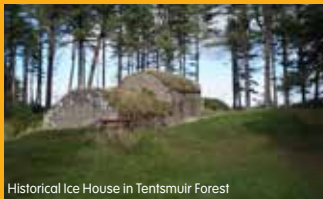
Historical Ice House in Tentsmuir Forest